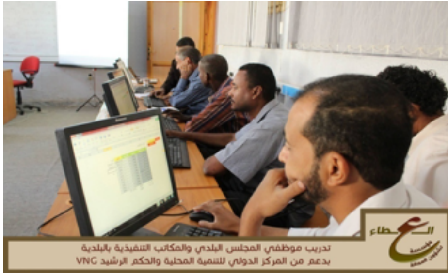
تدريب موظفي المجلس البلدي والمكاتب التنفيذية بالبلدية بدعم من المركز الدولي للتنمية المحلية والحكم الرشيد VNG