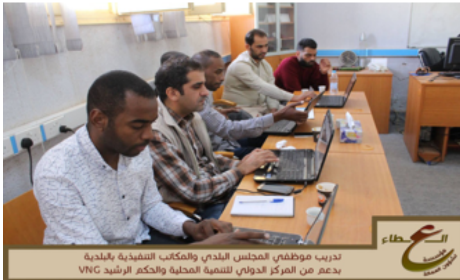
تدريب موظفي المجلس البلدي والمكاتب التنفيذية بالبلدية بدعم من المركز الدولي للتنمية المحلية والحكم الرشيد VNG